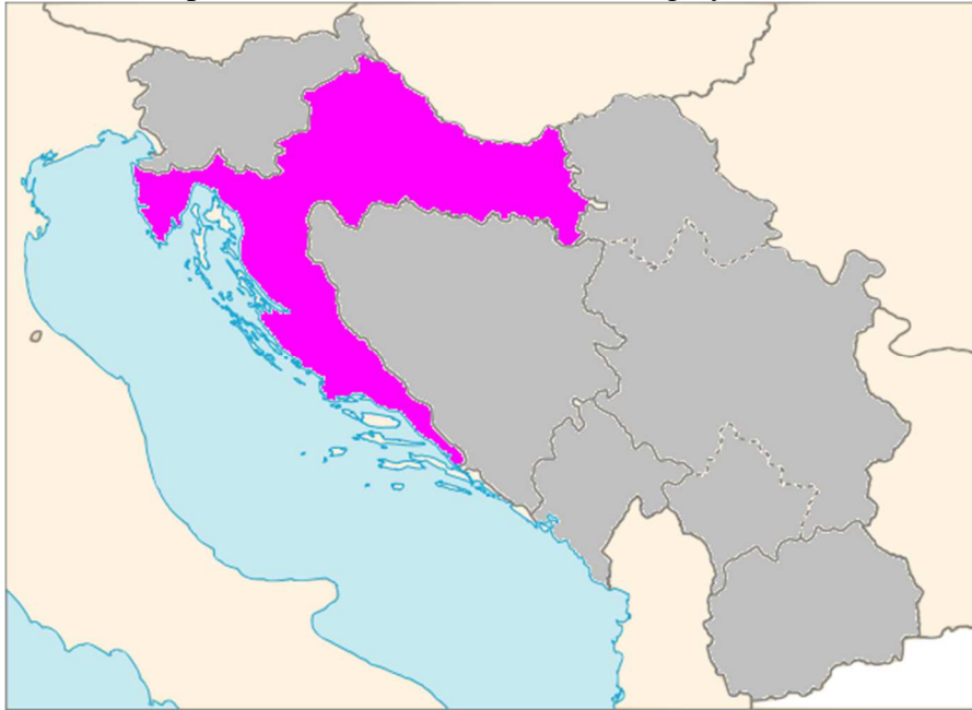
Map 1. COBISS in YUGOSLAVIA (grey surface)